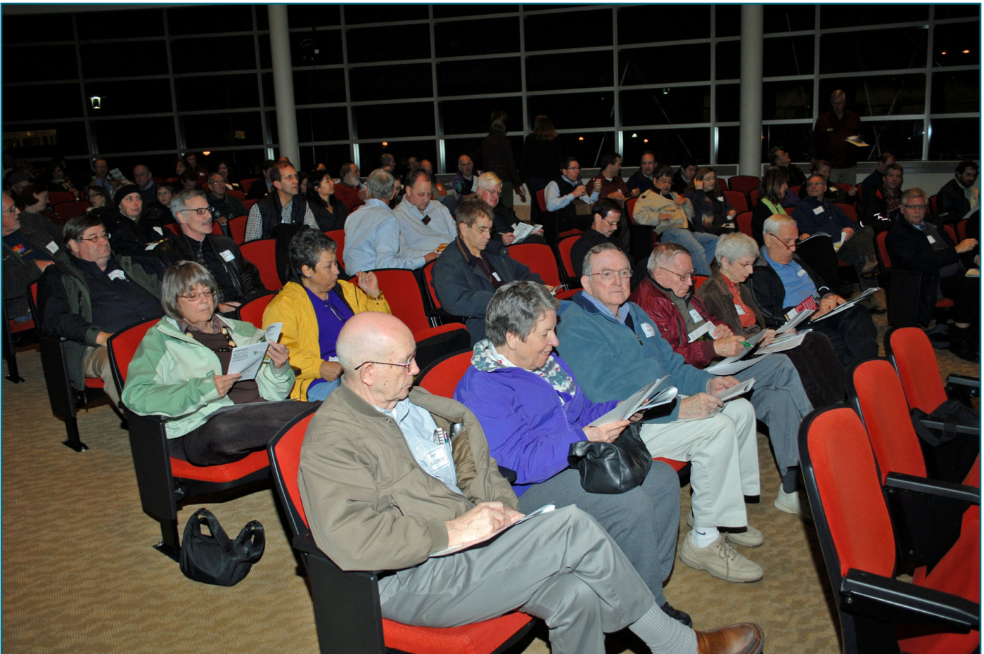
Members of the public at a Transportation Master Plan outreach event.

Online, the City maintained a web page for the TMP where users could review content and answer an opinion questionnaire on the progress of the TMP update. The questionnaire stood open between and received 43 responses which were generally supportive or strongly supportive of the TMP. Over 400 people opted in to a mailing list to receive TMP updates. Also as part of the community involvement process, the City solicited feedback from the public through its Facebook and Twitter accounts. The public also had the opportunity to submit comment on the Transportation Master Plan at two public hearings on April 10th and April 24th 2013, which were hosted by the Redmond Planning Commission during the public comment period. Six individuals gave comment at those meetings.